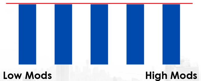
Quintile Test: Current Program